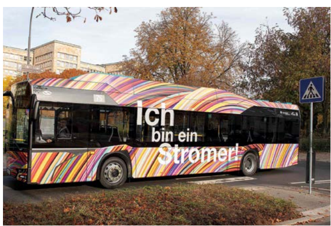
On route 75: the new E-buses.

On 9th December 2018 five new E-buses went into operation on route 75 in Frankfurt. The vehicles on the Ring Line, which connects Bockenheimer Warte, Uni-Campus Westend, Palmengarten and the Botanical Garden, have a battery capacity of 240 kWh which enables a range of 150 kilometres a day. The batteries can be recharged at night. Frankfurt's buses and lightrail trains are already making a considerable contribution to environment-friendly mobility in Germany's commuter capital.