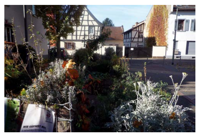
The Kirchplatz Garden in Ginnheim.

• "Shortcuts to combatting climate change" At the end of August 2016 Frankfurt's Municipal Energy Agency called on citizens involved in clubs, associations and foundations to apply for funding as part of their initiatives with neighbourhood projects for climate protection. The aim was to make financial sponsoring available for project proposals in the framework of the BMU, the Federal Ministry for the Environment, Nature Conservation and Nuclear Safety's call for funding "Shortcuts to combatting climate change". At the end of 2017 the three winning projects in the Frankfurt competition received BMU funding approval for the projects they submitted. This meant that, from the end of 2017/ start of 2018, many projects could start their work, such as the meeting point in the community garden "Tortuga Eschersheim", the "Climate Workshop Ginnheim" and the "Heddernheim im Wandel – Starke Nachbarschaften für Klimaschutz und Lebensqualität" (The changing face of Heddernheim - Strong neighbourhoods for climate protection and quality of life).