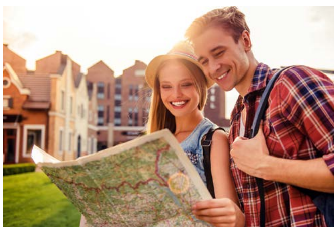
The climate protection city map documents Frankfurt's climate protection projects online.

porated into the Mobility section and currently there are about 4,300 climate protection projects listed in the Frankfurt city area.