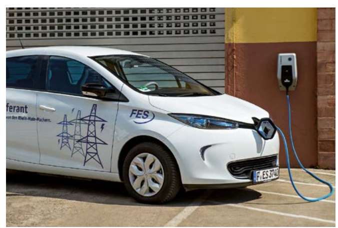
Eight new charging stations for E-vehicles.

In 2017/18 the FES Frankfurter Entsorgungs und Service GmbH installed two new photovoltaic systems on the roofs of their properties. The FES now operates eight of its own PV plants in Frankfurt and one in Mainz-Kastel and areas of the solar park in Dreieich-Buchschlag. In 2018 the renewably generated electricity produced accounted for 96.5 percent of the FES-Group's requirements.