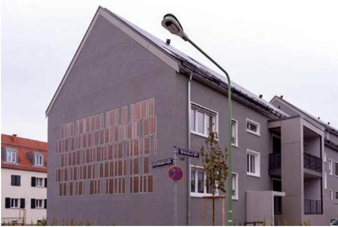
Organic photovoltaics on a facade.

and air source heat pumps, more climate-neutral energy is generated than the residents consume. This project proved that highest standards in energy efficiency can be applied, not only in new buildings, but also in the refurbishment of existing flats from the 1950's. The experience gained could be used nationwide for renovating thousands of similar types of houses.