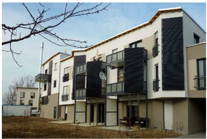
External West view of the "Energieautarkes Haus".

The Energy-self-sufficient House Frankfurt is linked with the KEG's neighbouring Energy-Plus project Kamelienstraße, so the regeneratively-produced energy can be stored or used in the two buildings, depending on the storage capacities and requirements.