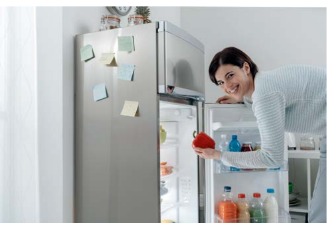
An energy-efficient refrigerator saves energy and costs.

In addition to the free consulting services for lowincome households the Caritasverband Frankfurt e.V., commissioned by the Municipal Energy Agency, also offers a refrigerator exchange programme. Vouchers are issued to support low-income households financially in buying new, energyefficient refrigerators. 226 households received the bonus in the period 01/2017-10/2018. The exchange programme is thus an effective instrument for CO<sub>2</sub> savings in the household.