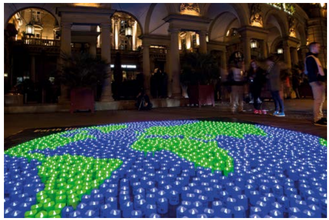
Lights out for climate protection.

In 2017 and 2018 the City of Frankfurt participated again under the motto "Gemeinsam Frankfurt bewegen" (Together we move Frankfurt) in the worldwide Earth Hour. Every year the Earth Hour, which was launched by the WWF, sends a clear global signal for climate protection. During the symbolic hour in March 2017 and 2018 millions of people around the globe switched off their lights on the same evening. From New York to Nairobi, from Paris to Panama over 7,000 cities in 184 countries take part every year. The Frankfurt Municipal Energy Agency in these two years ensured a blackout of the Skyline and appealed to companies to switch off the lights in their buildings for one hour.