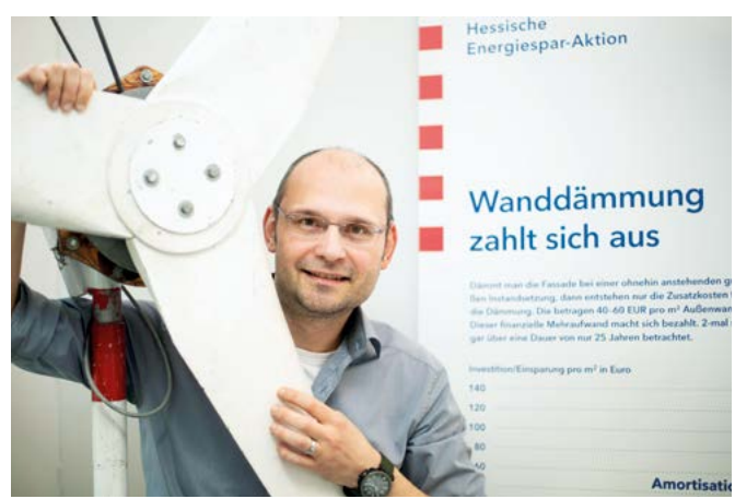
Energiepunkt; independent, grassroots counselling.