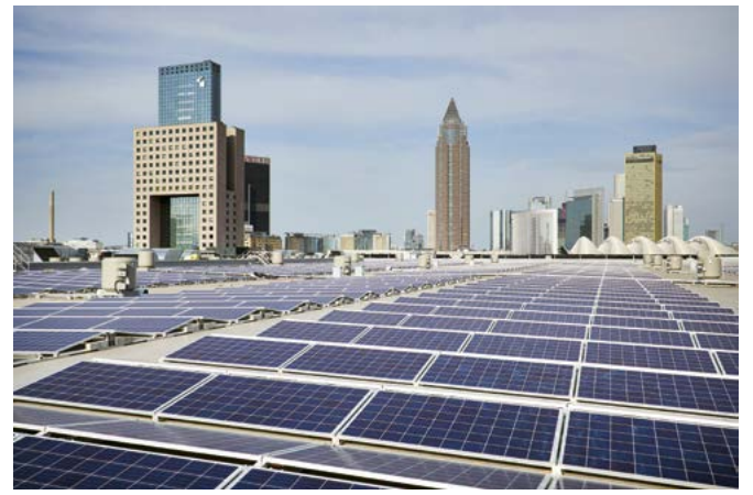
Energy harvesting for internal use – the new solar plant on the roof of exhibition Hall 12.

Frankfurt itself. The plant occupies an area of about 9,000 square meters and consists of 5,300 solar modules. In the future over 1 GWh of electricity for internal consumption will also be produced annually, which corresponds to the requirements of 241 households or about six percent of the exhibition grounds' current basic needs.