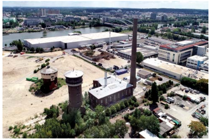
Climate-neutral biogas from bio-waste.