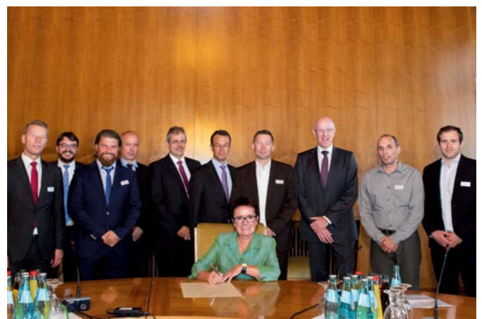
Signing the LEEN contract in 2016.

The CO_2 savings already achieved amount to over 19,000 tonnes a year which corresponds to the annual CO_2 storage capacity of 1,500-1,900 hectares of mixed forest in Germany.