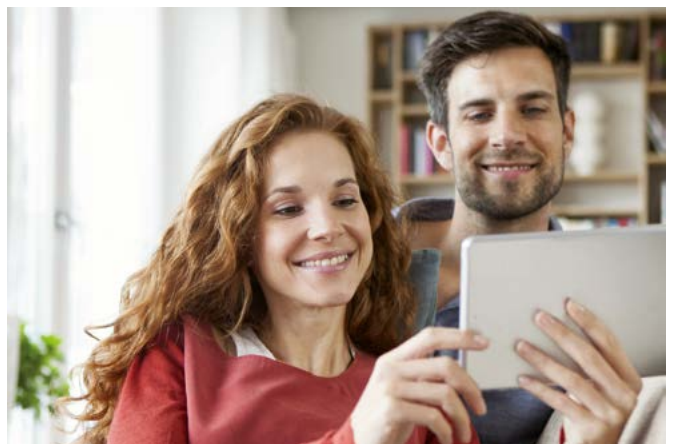
The electricity savings bonus is a monetary incentive to encourage households in Frankfurt to save energy.

Frankfurt-spart-Strom for Households is a Municipal Energy Agency programme to motivate households in Frankfurt to more conscious use of electricity. At the heart of the programme is the electricity savings bonus. The bonus is a monetary incentive to motivate consumers to look more closely at the question of saving energy in their own homes. The Municipal Energy Agency uses a variety of communication channels to make the energy-saving targets for electricity known. The Frankfurt-spart-Strom project team makes contact with consumers through activities in the social media or conventional brochures and flyers.