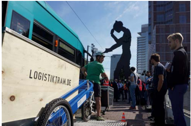
The idea of a logistics tram is highly acclaimed in Frankfurt am Main.

In partnership, the winners of the "Climate Protection Ideas Competition" (riemanndesign and Sachen auf Rädern), the City of Frankfurt, the House of Logistics & Mobility (HOLM) GmbH, the Frankfurt University of Applied Sciences (UAS), the IHK Frankfurt, the Climate Alliance and the VGF in summer 2018 developed the concept for the pilot. Hermes Germany GmbH, the dispatch service provider, was also included in the project.