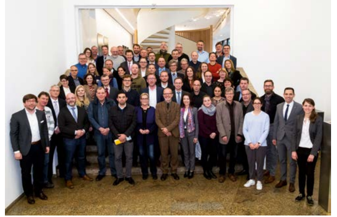
Closing event Ökoprofit Round 2017.