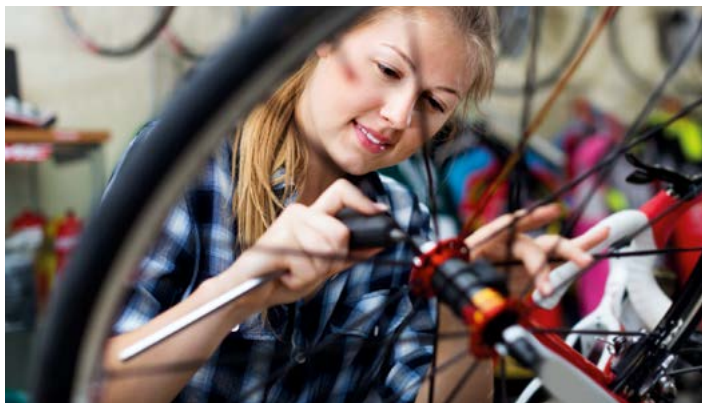
13 Repair Cafés (as of 2018) in Frankfurt

Climate protection in a big city can only succeed when the whole urban community participates and everybody makes a contribution. In the Masterplan process Frankfurt has adopted many ideas and suggestions submitted by citizens. These include Repair Cafés in different parts of the city where clapped-out bicycles are restored to their former glory or electronic appliances are repaired. The gratifyingly rapid proliferation of the Repair Cafés proves that there is a great demand among the population for these facilities: Whereas in 2013 in Frankfurt there were no Repair Cafés at all, by 2018 there were already 13 active locations, which all operate on a volunteer basis. The concept of the New Resident Information Pack also stems from citizens. The pack was distributed at the start of the summer and winter semesters 2017 on the campus of the Goethe University Frankfurt during "Unistart" (the Fair for Frankfurt University's new students). The new students constitute a very large and promising target group of about 4,500. "New" residents received valuable hints on lowering energy costs, purchasing energy-efficient household appliances or car sharing offers in the city. The information pack is available free of charge from the Municipal Energy Agency at energiereferat@stadt-frankfurt.de.