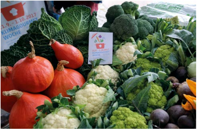
Climate Gourmet Week, an annual event.

In Frankfurt the exhibition was on display at the Land and Genuss Trade Fair, at the Climate Piazza in the Zoo and in the Central Library during the Climate Gourmet Week. In cooperation with Frankfurt Zoo and the Zoo School, in the week after the Climate Piazza the learning workshop "Climate Gourmet" was held with pupils from grades eight to eleven. With experiments and inter-active learning stations in the learning workshop the school classes learn how climate protection and nutrition are linked.