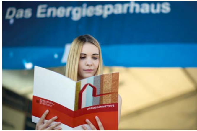
New brochures on climate protection and renewable energies.