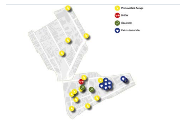
Existing climate protection activities in the sustainable commercial area. As of October 2018.

Until 31st December 2018 the project will also receive 150,000 euros from the "Experimental Housing and Urban Development" (ExWoSt) research programme which was initiated by the Federal Institute for Research on Building, Urban Affairs and Spatial Development and the Federal Ministry of the Interior, Building and Community.