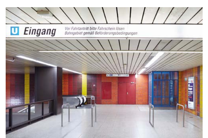
Höhenstraße U-Bahn station with new LED lighting.

This was followed in 2018 by the lighting in the U-Bahn stations Dom/Römer and Leipziger Straße and the tunnels between Konstablerwache and Seckbacher Landstraße. This renewal process is to be continued on an ongoing basis. The much more efficient LED luminaires have led to significant energy savings of over 50 percent below ground and up to 90 percent above ground, despite the higher luminosity. Together with the updated lighting at several tram stops consumption fell by about 350,000 kilowatt hours (kWh) annually.