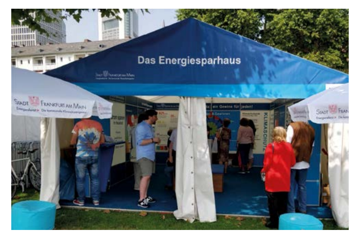
Lots of visitors to the "Save Energy" pavilion at the Museum Embankment Festival 2017.

In August 2017 the Municipal Energy Agency was again represented with its "Save Energy" pavilion at the Museum Embankment Festival. Many Festival visitors informed themselves at the stand about Frankfurt's climate protection targets, picked up brochures and flyers and took part in the Climate Quiz. As every year the lighting wall, where visitors can try out energy-saving LED lights, was extremely popular. People took a breather on the new seat upholstery under the big sun-umbrellas in front of the marquee and were delighted with the climate protection fans.