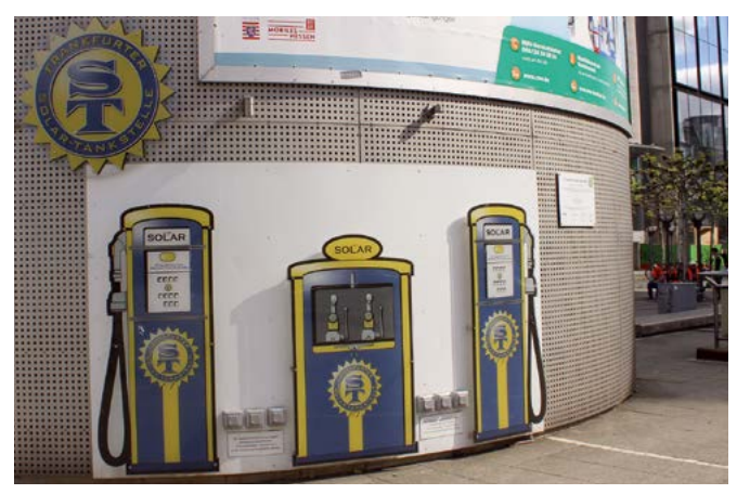
The solar filling station on Zeil was one stop on the Climate Protection tour of the city centre.

In summer 2017, to illustrate climate change in major cities, Frankfurt's Environment Department organised its first multi-day information event on the Roßmarkt in Frankfurt, one of the hottest places in the city. The "Climate Piazza" event invited residents to get information at the exhibition stands, to discuss with other people, to participate in talks, workshops and guided tours or simply chill in a summer lounge.