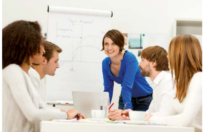
Experience exchange at local, nation and international level.